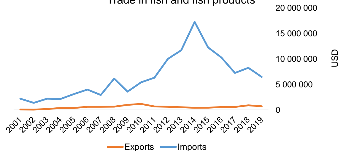
Trade in fish and fish products